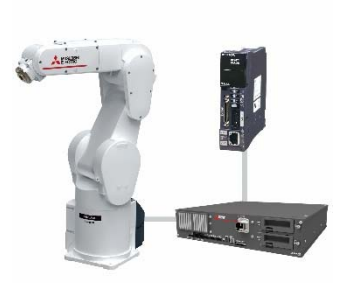
Programmable controller MELSEC iQ-R Series