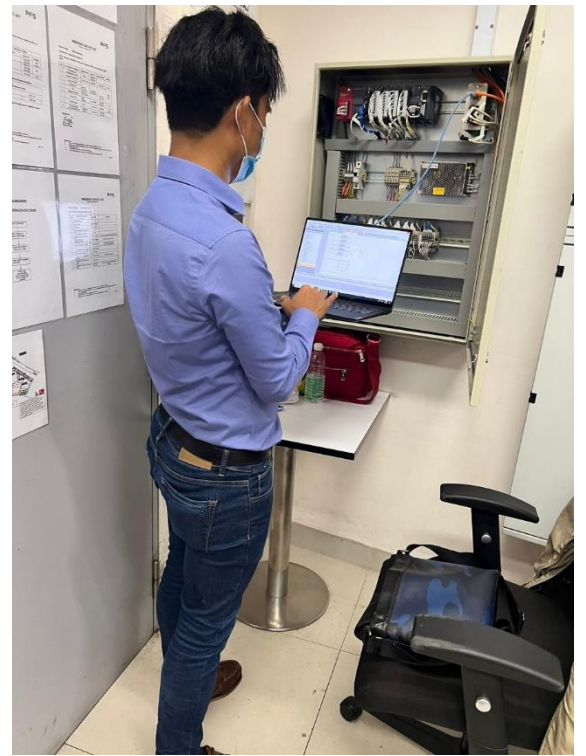
Quarterly Maintenance Service