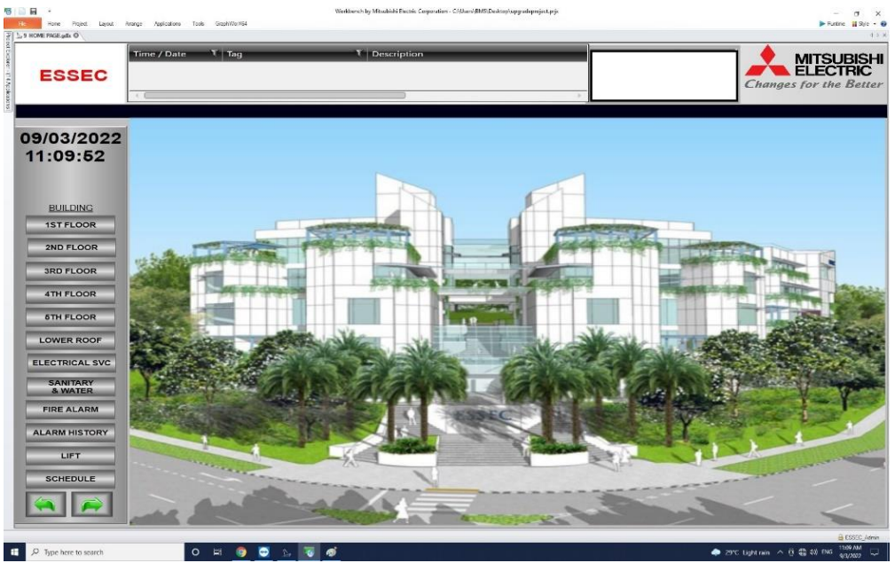
BMS Graphic Home Page

Efficiency is key in monitoring and controlling equipment and ancillary facilities within a building. Being a one-stop solution provider, Mitsubishi Electric was thus a choice partner with the economies of scale to offer competitive, compact and customized solutioning to meet ESSEC Business School's requirements.