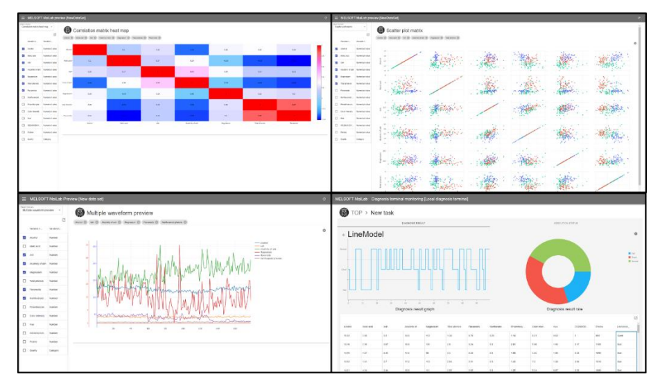
MELSOFT MaiLab displays factory data and analysis/diagnosis results

- Tablets can be used to check production status remotely.