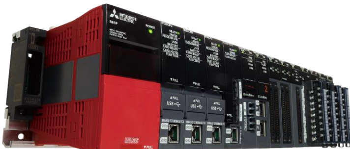
MELSEC iQ-R: Advanced technology, thoughtful design

Speed is also a keyword with iQ-R Series. Not only are the processors optimized for consistent, reliable manufacturing operation, and are up to eight times faster than the proceeding QCPU, but when combined with the new high speed bus, users will see an increased throughput of around 40 times the current iQ Platform which was already one of the fastest systems on the market. This massive speed increase means manufacturing with greater response which can be used to increase quality through more rapid reaction to changes in parameters, perform greater control and co-ordination between complex motion tasks or even greater resolution for energy management tasks such as load balancing or peak management for example. iQ-R really is putting its users in control.