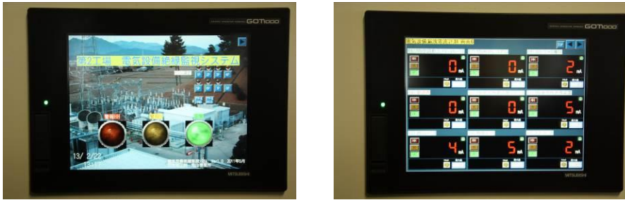
Main display screen (left) and individual monitoring results display screen (right) on the GOT. Values exceeding the set threshold values light up in yellow or red.

Furthermore, it easily identifies moisture-caused leakage at panel board level, and the ability to see leakage current by circuit numerically allows the maintenance staff to grasp status trends and respond more quickly. Besides, Nitto was able to create the GOT display screens and monitor the programs themselves.