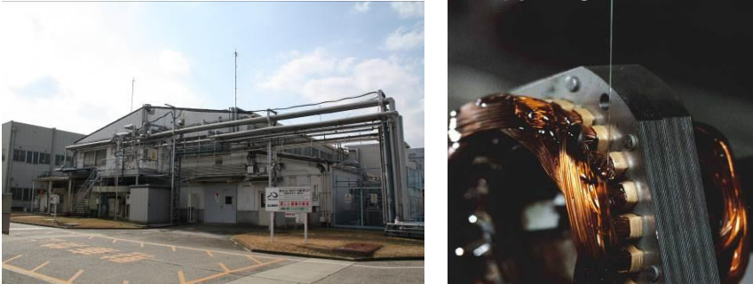
Plant 2, the oldest at the Kameyama Plant, started operation in 1969; the coil varnish it produces

The Kameyama Plant 2 has been in operation since 1969. Their main concerns are leakage from old wiring and electrical machines which could lead to fire.